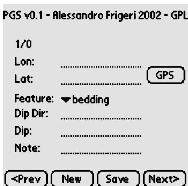
Figure 2: PGS: The GUI

in a structural geology survey. WABA together with Waba Extras extension written by Rob Nielsen 3 allows to insert either simple data field to be filled, or pup-up lists with selectable entries, as the case of feature entry in figure 2.